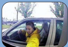
Super Vision II

Samsung's Super Vision II Wide Dynamic Range technology produces detailed information from an image's dark areas without saturation of the bright areas.